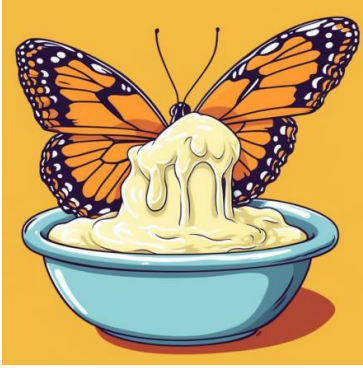
A creamfly? 😊