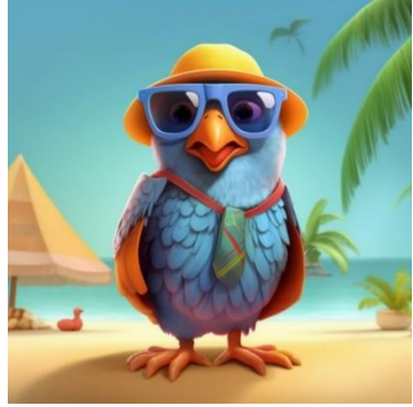
A summer bird? 😊

“It was lovely to meet you!” said the butterfly. “If you don’t mind, I would like to come visit you again”.